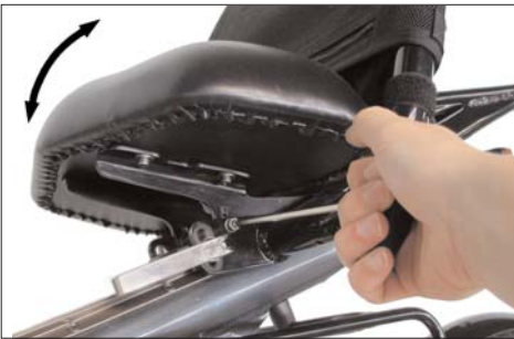
Unscrewing the bolt on the left side under the seat cushion

You will find the most comfortable seating position when you try different combinations of the angle of the cushion with its horizontal position, as described in the following.