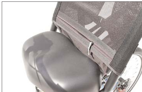
Clean the back rest and the zipper with lukewarm water.

At the front quick release there are on both sides knurled washers between the quick release and the aluminum fittings. These washers provide the clamping force necessary for the adjustment of the angle of the back rest. The knurling might affect the coating in the clamping area slightly but it does not interfere with the functionality.