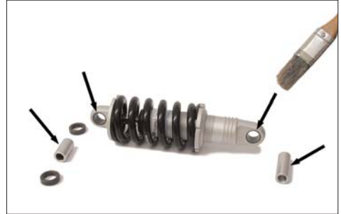
The bushings of the rear spring element need to be lubricated once a year.

Please also note the maintenance instructions of the damper manufacturer provided with your bike.