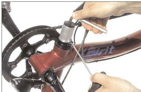
Adjusting the headset with mounted adjustment bushing.

Put the adjustment tube on the steerer fork tube above the clamp. Screw the end cap tightly into the steerer tube.