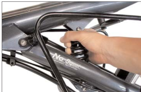
Turning the adjustment ring for the pre-load.

The adjustment ring should be turned no more than five turns (measured from the relaxed position) towards the spring. If the suspension compresses still too far even after six turns, the spring is too soft and has to be replaced by a harder spring. A too big pre-load of a too soft spring does not take advantage of the full comfort potential. For instructions on changing the spring see page 45 .