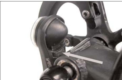
You switch on the hub dynamo lighting system with the integrated switch on the front light.

The SON hub dynamo is highly efficient and works silently. When the light is switched off, it has a very low turning resistance. Although you can feel the single poles of the used permanent magnets very distinctly when turning it by hand, the real rolling resistance is minute. (The loss is below 1 W at 15 km/h / 9,5 mph).