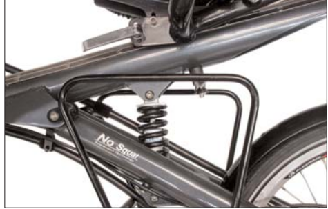
Rear suspension element of the Spirit

Your Spirit comes standard with a steel spring rear shock. As an Option, the air shock DT-Swiss XM-180 can be installed. Please read the manual of the rear shock manufacturer for details.