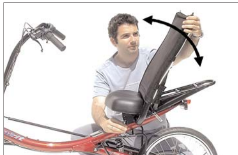
Adjusting the Seat Back

Another advantage of a low seat back angle is better aerodynamics. In a recumbent position you don't offer much area for head wind which can result in a big plus in velocity.