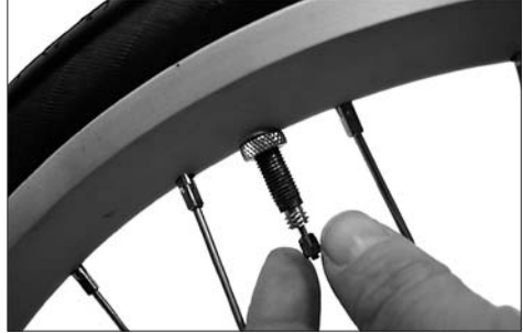
Before pumping up the tire, you have to unscrew the little knurled nut on the valve.

After you have pumped up the tire to the maximum pressure pull off the pump knob. Secure the valve by turning the knurled nut on the threaded rod properly against the valve body. Finally put on the valve cap again.