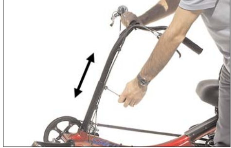
You can adjust the height of the handlebars by undoing the clamping screw.

You adjust the height of the handlebars at the clamping at the upper end of the lower part of the stem.