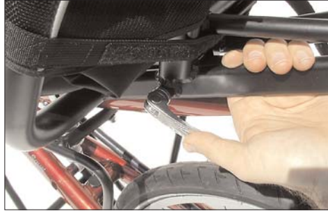
The quick release levers must be closed firmly. Hold the seat frame with your fingers to enhance your thumb's power.

The wheels are equipped either with screws and nuts at the axles or with quick releases. The following instructions are also valid for the wheels. Please read the instructions of the quick release manufacturer.